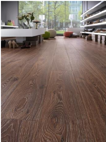
ROBUSTO: the decor Timeless Oak (D 3590)

The following images are available in print-ready resolution for downloading. They may be used in publications free of charge provided that they are credited as indicated.