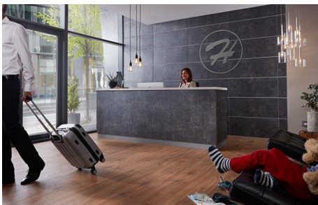
MAMMUT: Capitol Oak Medium