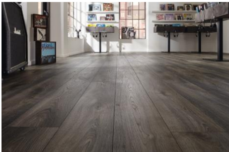
MAMMUT plus : the decor Macro Oak Grey (D 4792)